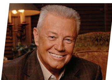
Jerry Savelle Ministries