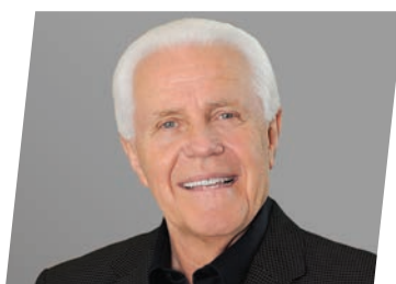
Jesse Duplantis Ministries