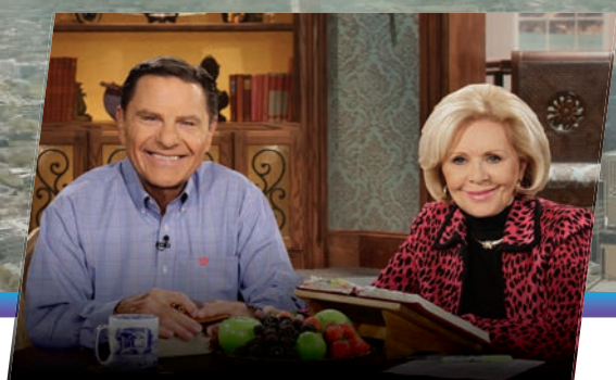
Believer's Voice of Victory, Victorious Living & God Wants You Well with Kenneth & Gloria Copeland