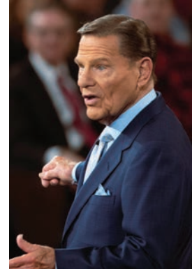
by Kenneth Copeland